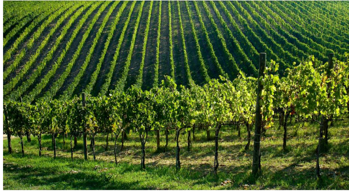
Aglianico, Mastroberardino Estates, Mirabella Eclano, Taurasi DOCG area