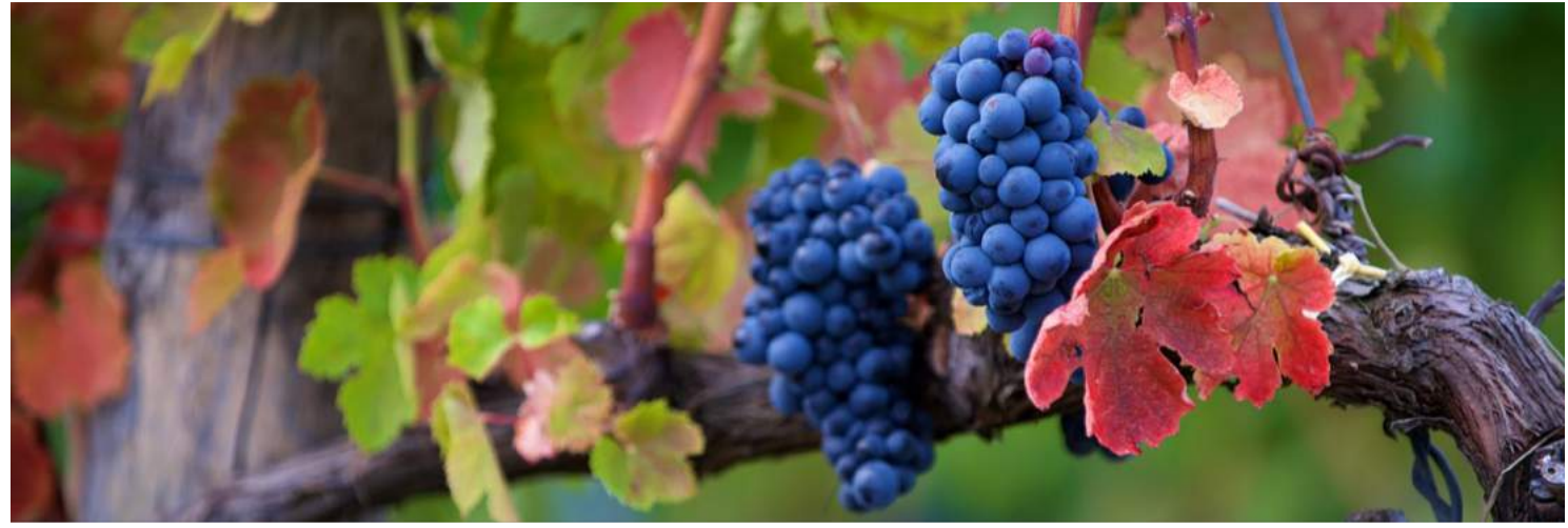
Aglianico, Mastroberardino Estates

The production of Stilèma Taurasi DOCG , as in the past, is the result of a composition and combination of micro-territorial stories that are different, yet synergetic in the generation of a unique and complex expressive force: the grapes are selected from five different family sites, among Pietradefusi , Montemarano , Paternopoli and Mirabella Eclano , at altitudes between 350 and 650 meters above sea level.