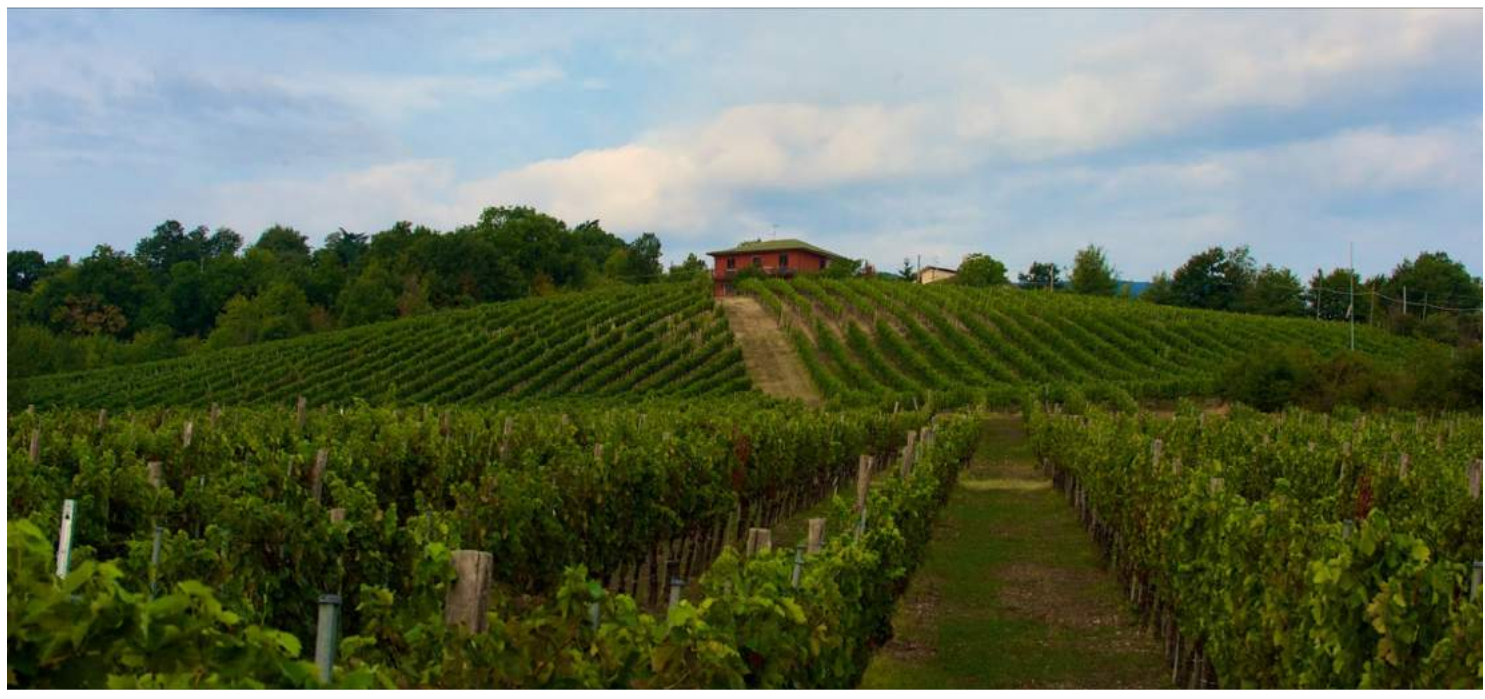
Aglianico, Mastroberardino Estates, Montemarano, Taurasi DOCG area

The distinctive elements in the wines of the Stilèma project start from viticultural choices, aimed at highlighting the characters of our mountain terroir, that cannot be expressed just in terms of high concentration and intensity. The historical roots talk about an approach of assembling selected grapes from different vineyards, in order to collect more complex nuances, and activities in the cellar that follow the same principles, enhancing the elegance, delicacy and finesse typically driven from our land.