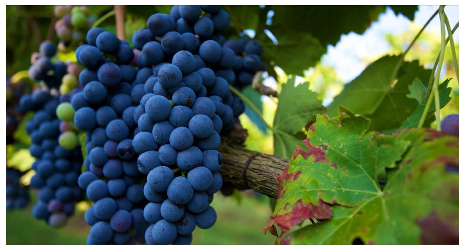
Aglianico, Mastroberardino Estates

A project begun at the turn of the millennium, with a series of experimental hypotheses starting from selected clones in pre-phylloxera vineyards and leading to a rediscovery of working protocols, both in the vineyard and in the winery, related to the time in which Irpinia wines affirmed themselves as the pick of the iceberg of a process of renaissance and revitalization of viticulture in our Country.