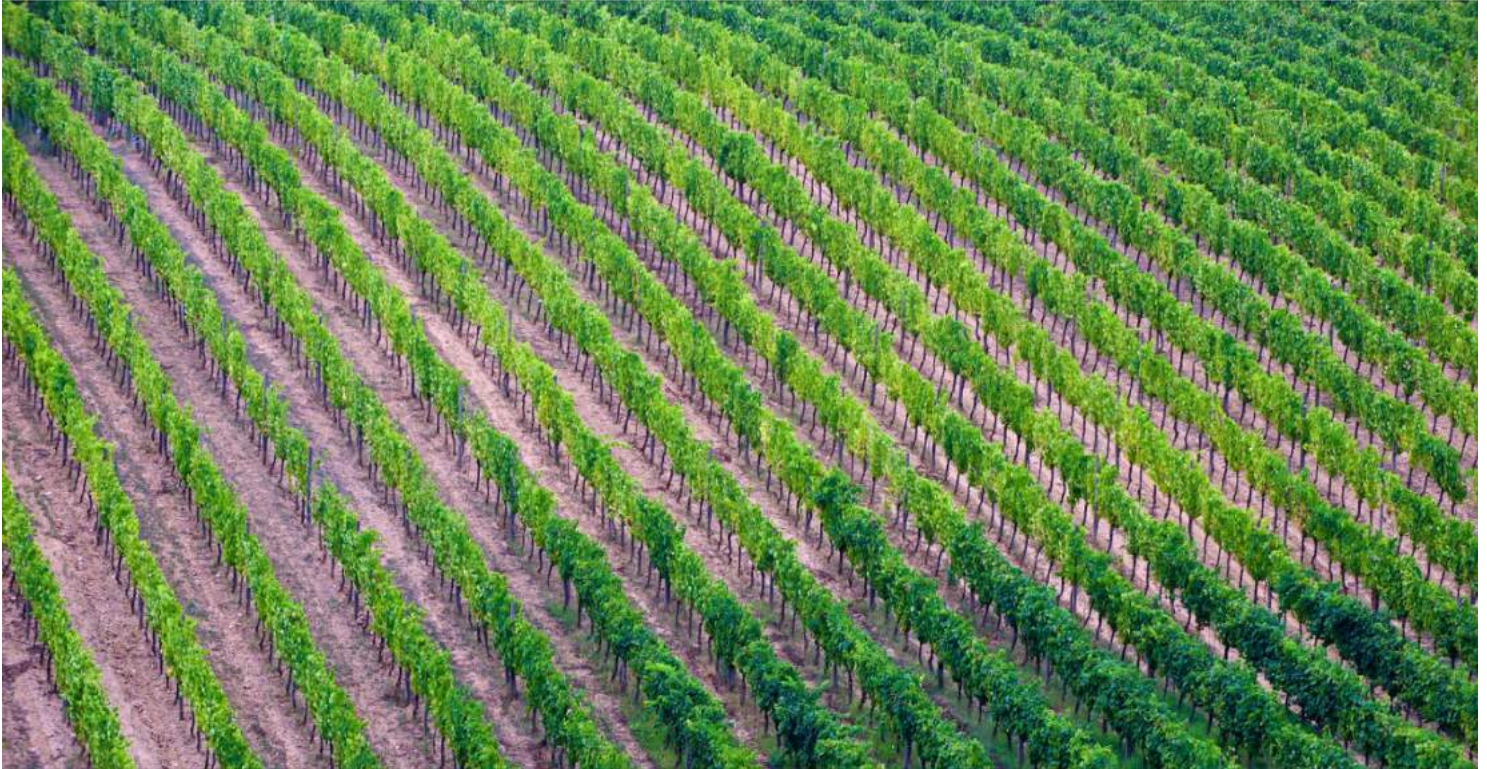
Fiano, tenute Mastroberardino

The distinctive elements in the wines of the Stilèma project start from viticultural choices, aimed at highlighting the characters of our mountain terroir, that cannot be expressed just in terms of high concentration and intensity.